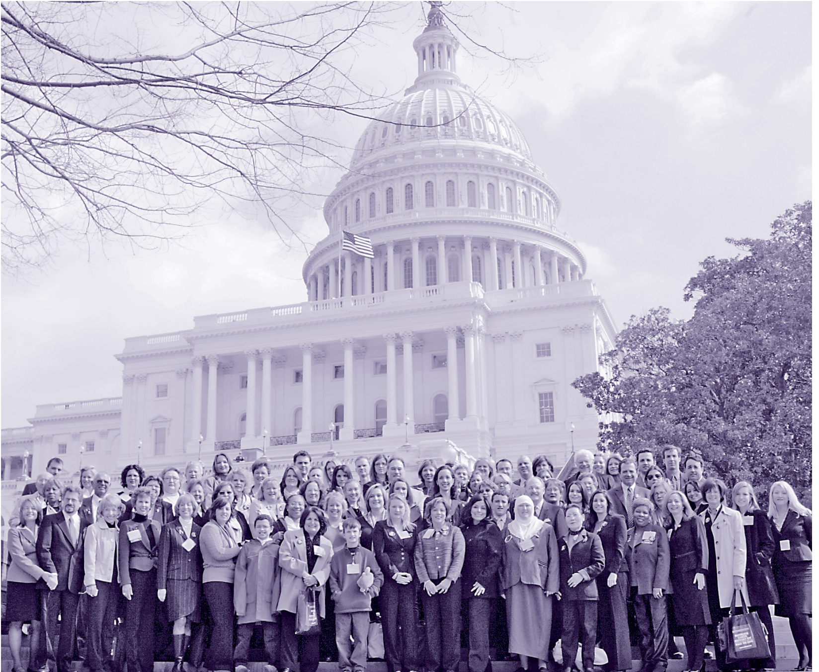
Advocacy Day, March 11, 2008 - Washington, DC

ADVANCE RESEARCH. SUPPORT PATIENTS. CREATE HOPE.