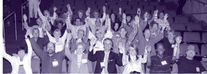
Twenty-nine survivors joined hands in camaraderie at the Pancreatic Cancer Symposium – Tampa held at Moffitt Cancer Center.

Please check www.pancan.org for information about our upcoming symposia. We invite you to attend and share the day with us.