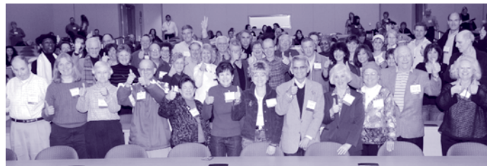
Forty-five survivors enjoyed the Pancreatic Cancer Symposium – Philadelphia at Thomas Jefferson University.