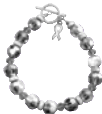
Chunky Swarovski crystal and silver bracelet