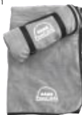
PanCAN fleece blanket