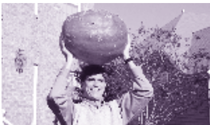
Dr. Randy Pausch “bench presses” a 50lb pumpkin!

When you first meet Dr. Randy Pausch, a youthful and energetic Carnegie Mellon professor who once had dreams of “being Captain Kirk”, the first thing you notice is his sense of humor and spirited laugh. This computer science pundit who knew exactly what he wanted to do in life by age 8, hardly mentions his pancreatic cancer, instead he focuses on how he achieved those life goals